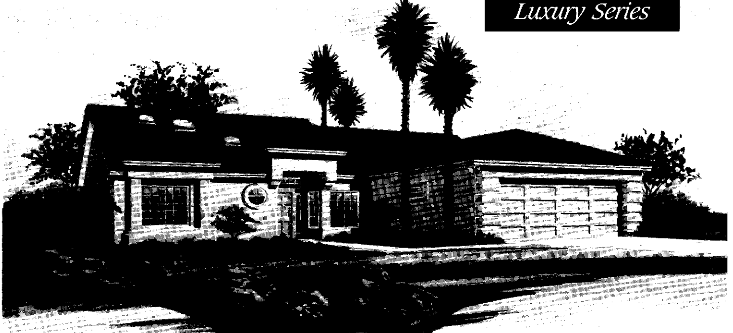
Exterior Design — A