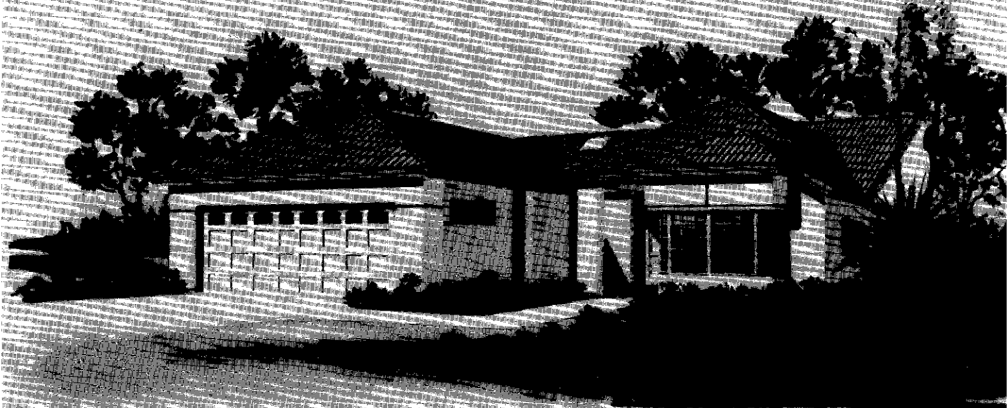
Exterior Design — A