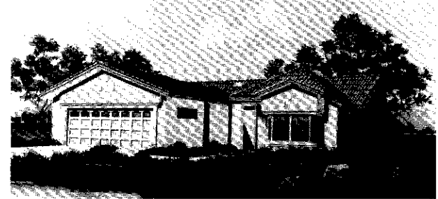
Exterior Design — C

1 Bedroom, Den (Optional 2nd Bedroom), 2 Baths, 1335 Livable Sq. Ft.