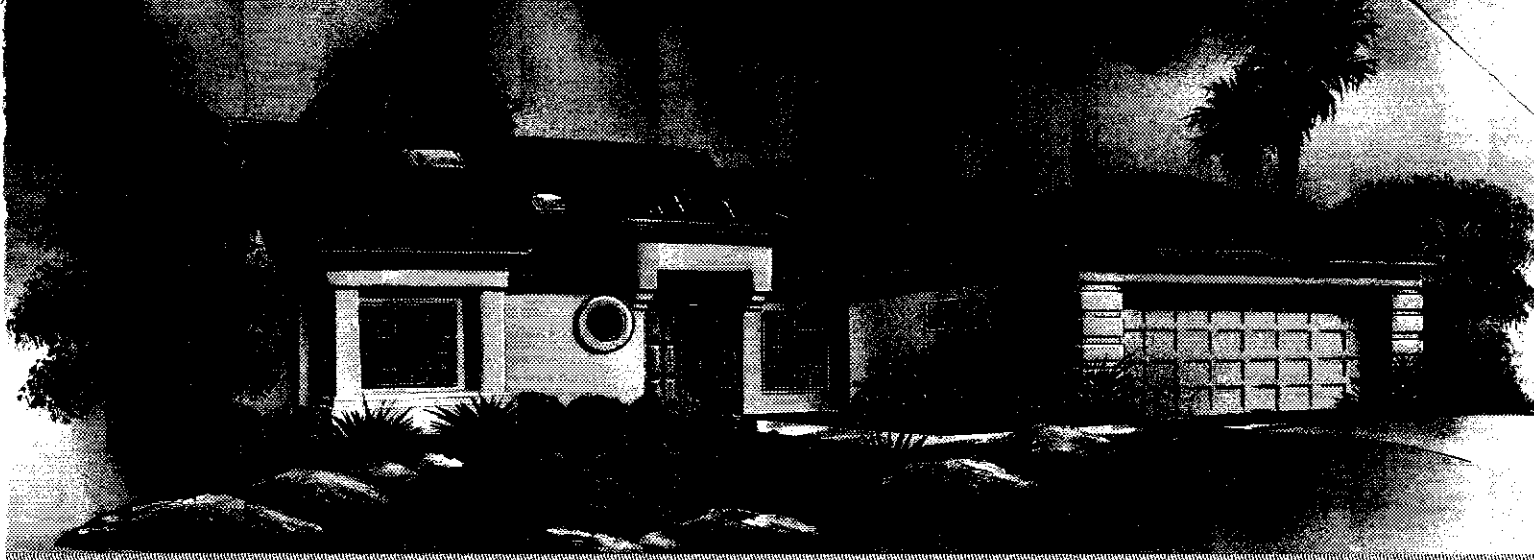
2 Bedrooms, 2 Baths, 2076 Livable Sq. Ft. - Exterior Design-A