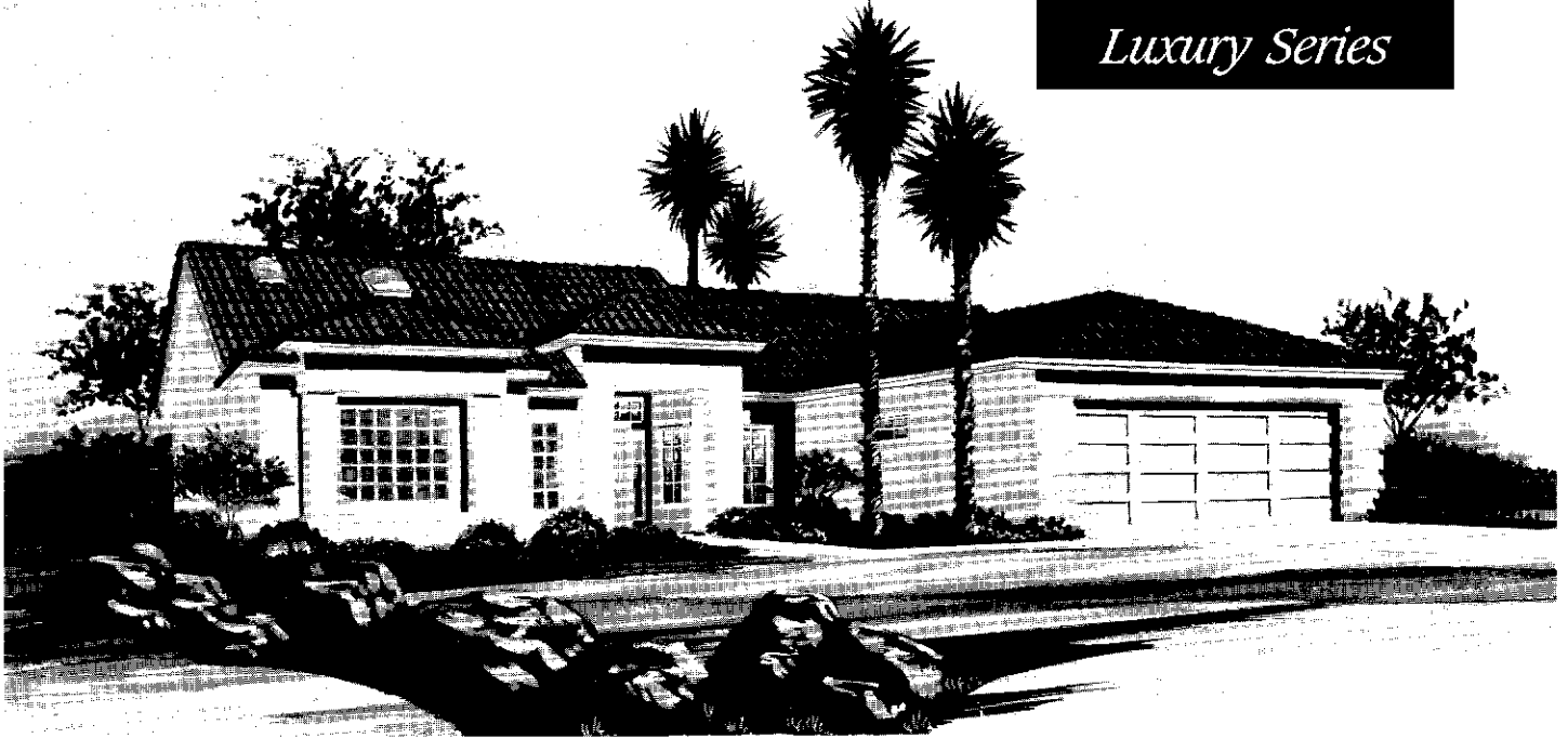
Exterior Design — A