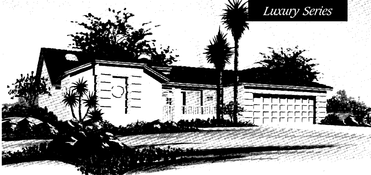
Exterior Design — A