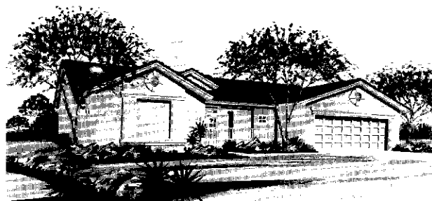
Exterior Design — C