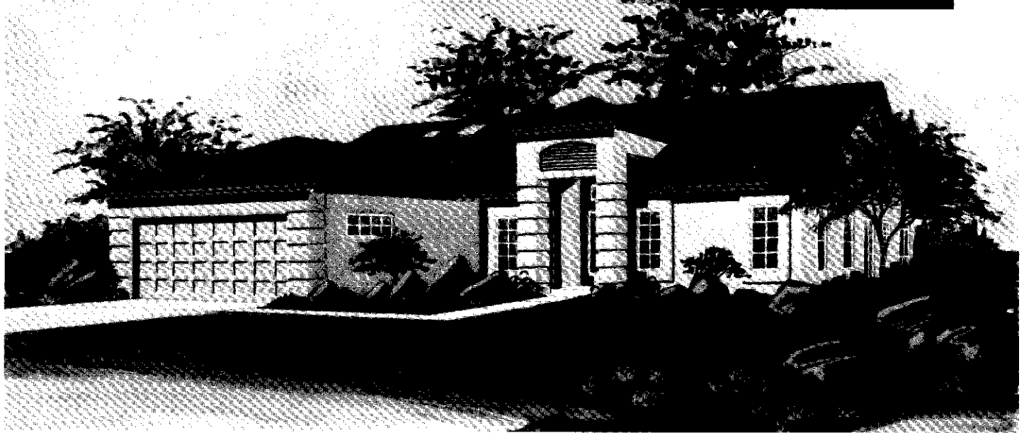
Exterior Design — A