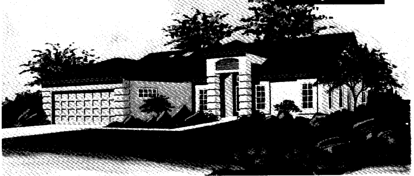
Exterior Design — A