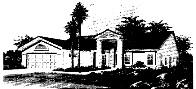
Exterior Design — B