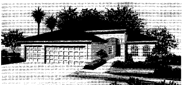
Exterior Design — C