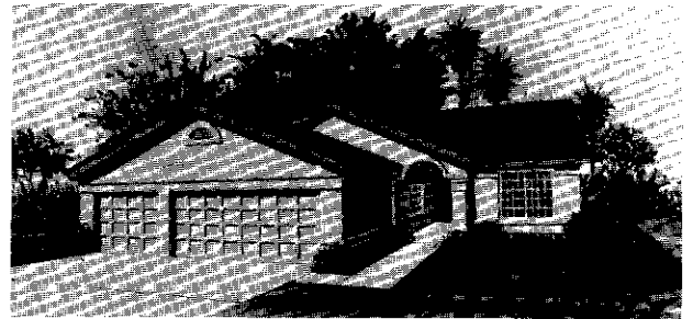
Exterior Design — A