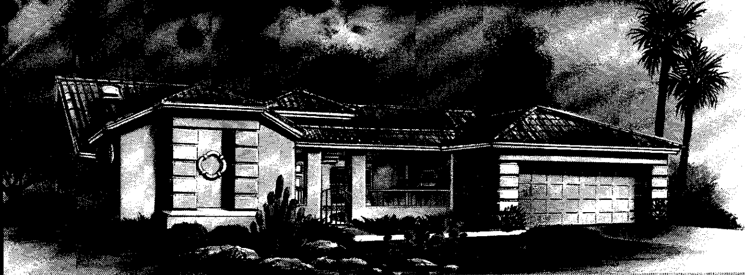
2 Bedrooms, 2 Baths, Guest Suite with Full Bath, 2311 Livable Sq. Ft. - Exterior Design-A