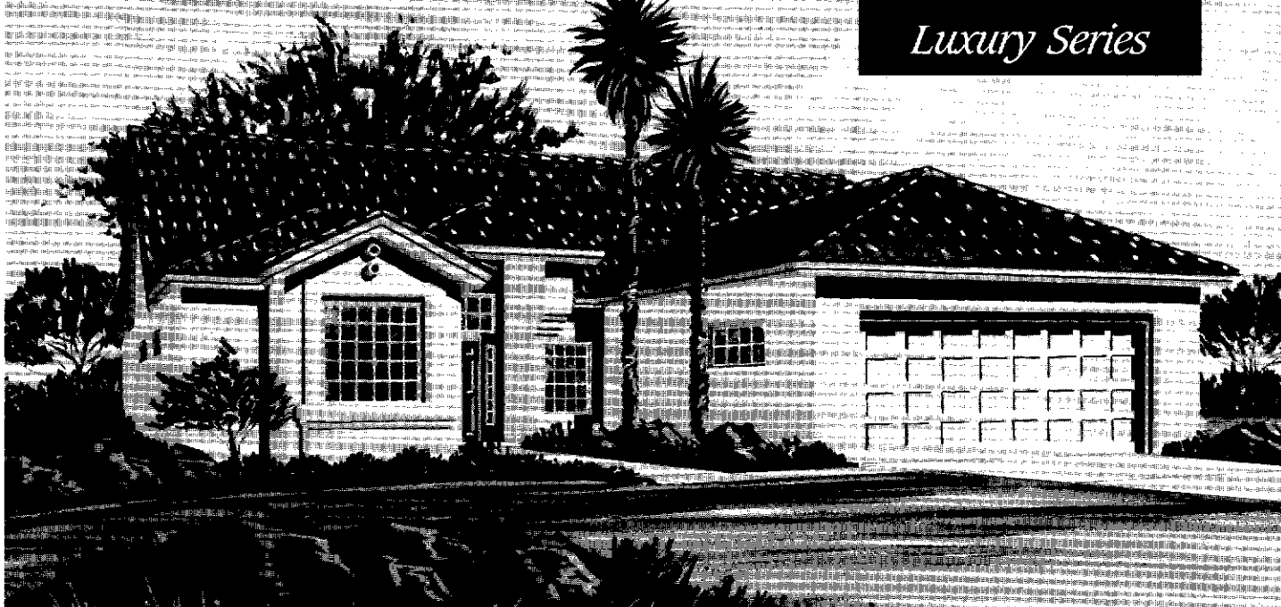
Exterior Design — C