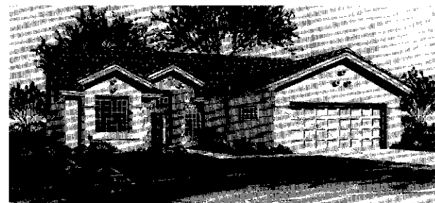
Exterior Design — B