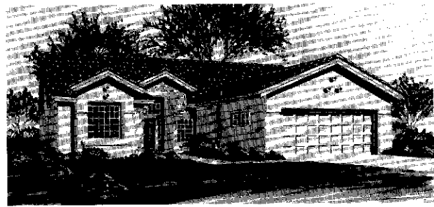
Exterior Design — B