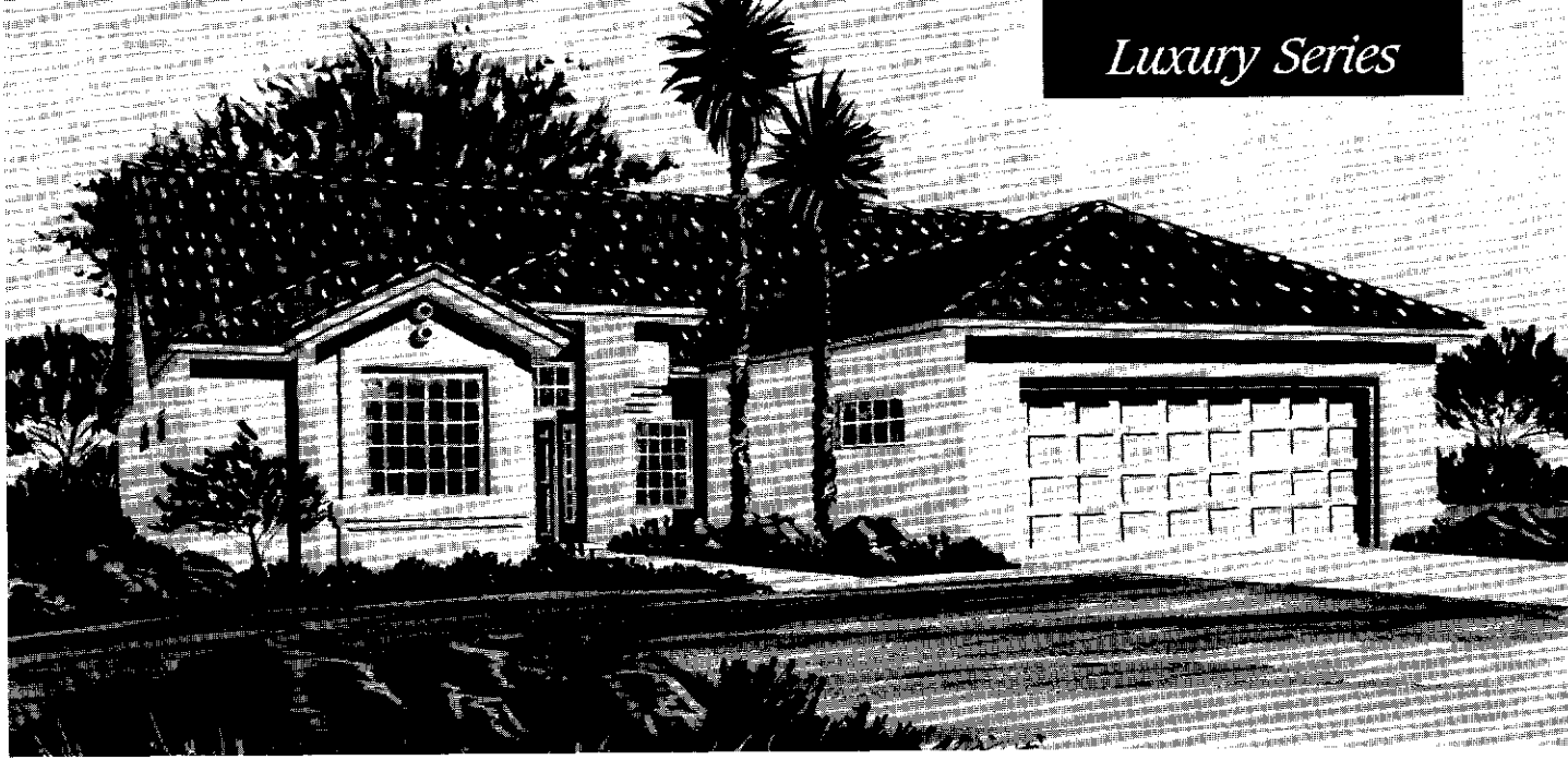
Exterior Design — C