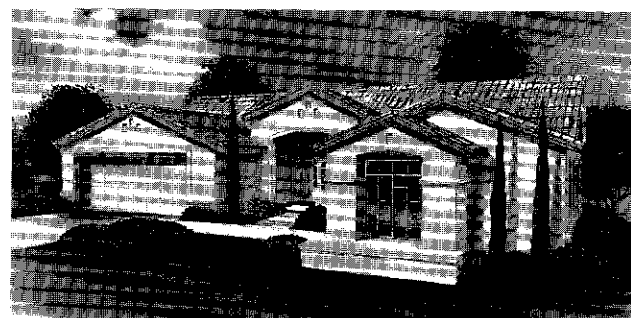
Exterior Design – B