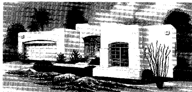
Exterior Design – A